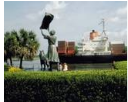
The "Waving Girl"

The Georgia Association of Historians will gather at the De Soto Hilton in Savannah on February 25-26, where about fifty papers or roundtables will be offered under the general theme: CONFLICT, COMMEMORATION, AND CONSERVATION: Explorations across Time and Place. Those who arrive on Thursday night are invited to an event at the one of Savannah's premier historic houses, the Davenport House. The program will present conversations between local (hypothetical) residents about real events and protocols in the 1820s, the time period interpreted at the Davenport. It is sponsored by the Friends of the Davenport House.